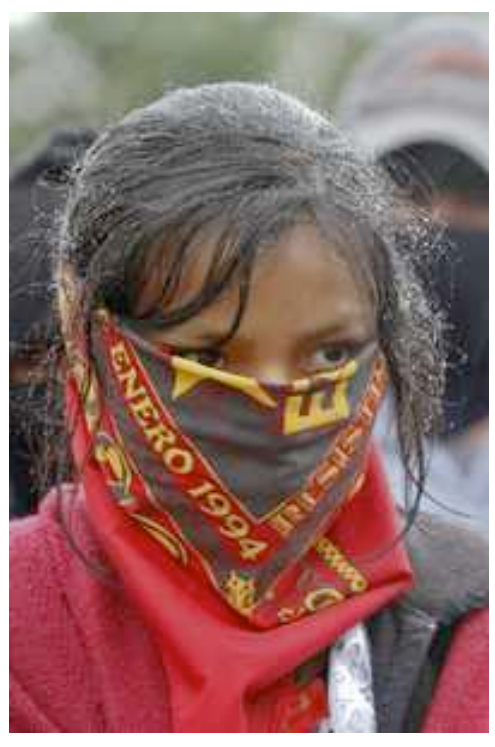
The presence of young women was particularly prominent.

[http://compamanuel.wordpress.com/2012/12/22/more-than-40000-zapatistas-mobilize-in-chiapas/]