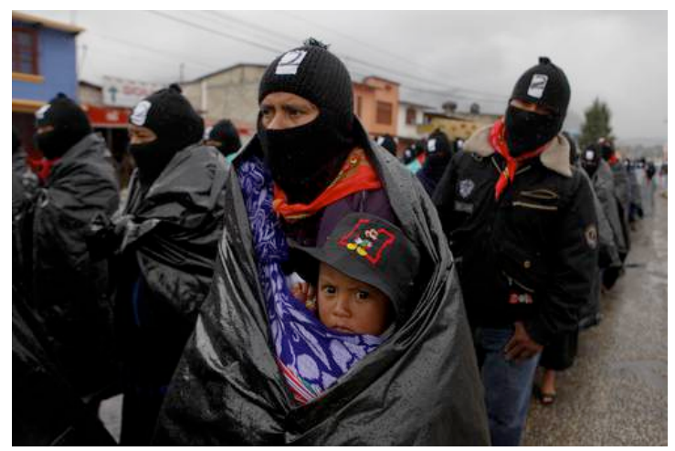
The EZLN support bases used silence as protest.