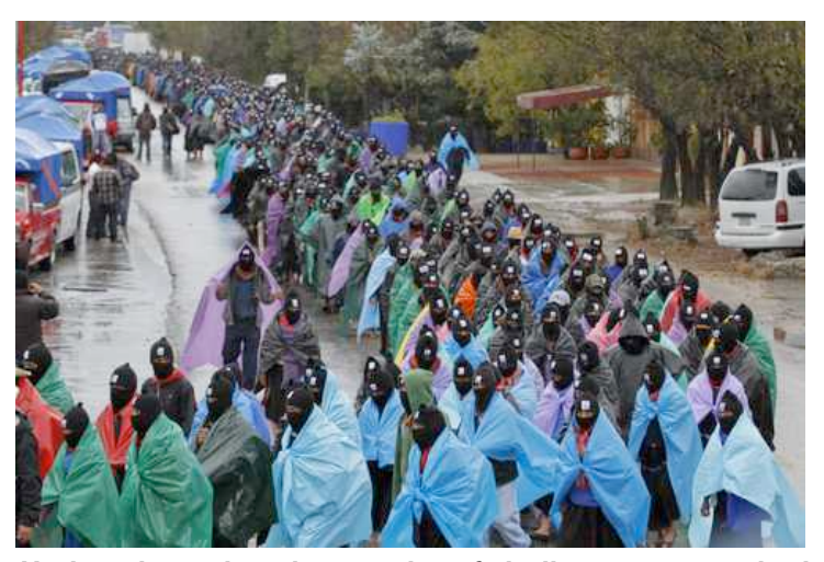
Under the rain, thousands of indigenous marched through San Cristóbal de Las Casas, Palenque, Las Margaritas, Ocosingo and Altamirano Photo: Víctor Camacho.