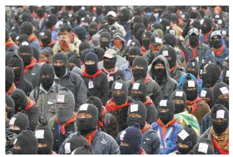
The indigenous wear a number according to the Zapatista zone to which they belong.

**Later they disappear in an orderly way